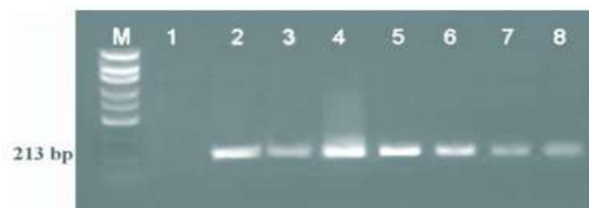
Fig. 1. Amplified product analyzed by 1.5% gel electrophoresis. Lane 1: negative blood sample for Toxoplasma, Lane : 2,3,5,6,7, 8 positive amplification. Lane 4 : positive control samples . Lane M molecular weight marker 100 bp