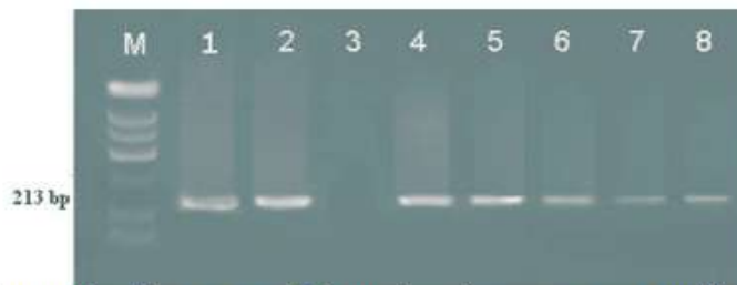
Fig. 2. Amplified product analyzed by 1.5% gel electrophoresis. Lane 1, 2, 8 positive amplification of brain, Lane 3 negative amplification from breast muscles, Lane 4, 5, 6 positive amplification from heart. Lane 7 Positive amplification from leg muscles, Lane M molecular weight marker 100 bp