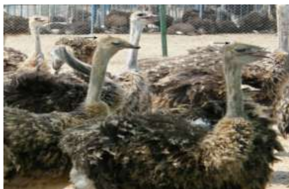
Fig. 3 Some ostriches showing eye affections (arrows)